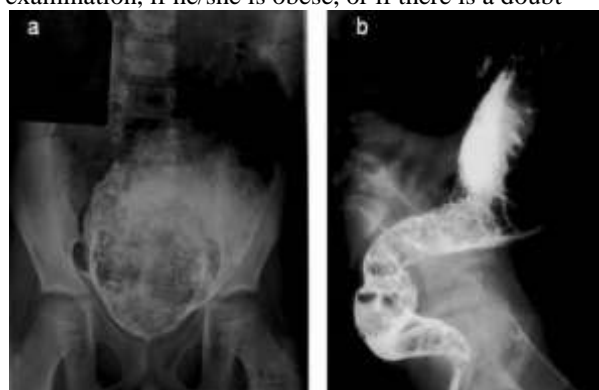
FIG. 2 (a) Barium enema (delayed film) of functional constipation; (b) Barium enema of a patient with Hirschsprung disease.

First step in the management of constipation is to decide whether the child has fecal impaction or not. This can be accomplished by abdominal examination (in half of the cases hard fecal mass or fecalith is palpable in the lower abdomen) [19], by digital rectal examination (rectum is usually loaded with hard stools), or rarely by abdominal X-ray. Routinely abdominal X-ray is not required to detect fecal impaction. However, if the child refuses rectal examination, if he/she is obese, or if there is a doubt