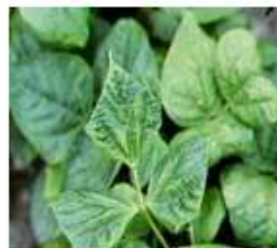
(B) Mosaic Virus