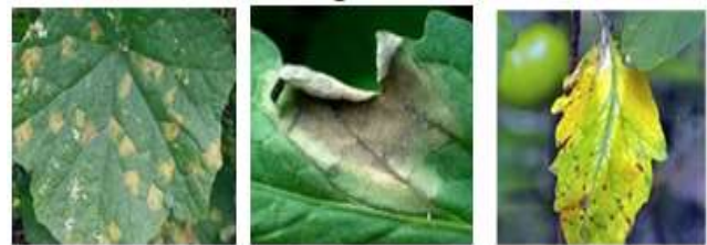
(A) Late Blight (B) Early Blight (C) Downy Mildew

wilting or withering of the plant, stunted growth, and abnormal or distorted growth patterns. Fungal infections can also cause lesions or cankers on stems, trunks, or branches, as well as fruit rot, root rot, and premature dropping of leaves or fruit. Some fungi also produce visible structures such as fruiting bodies or spores on the surface of the plant. Proper identification of the specific fungal pathogen is important for effective treatment and management of the disease.