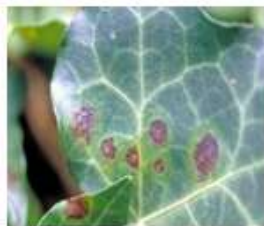
(A) Bacterial Leaf Spot

Viral diseases in plants can cause a wide range of symptoms, including yellowing or mosaic patterns on leaves, stunted growth, distortion of plant parts, and necrosis. These symptoms can vary depending on the type of virus, the plant species affected, and environmental factors. Some viral diseases can also be spread through insect vectors or infected plant material, leading to further spread and damage.